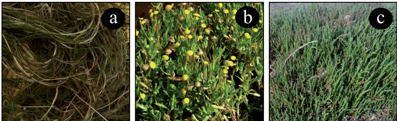
FIGURE 2. Pictures of the aquatic macrophytes consumed by Fulica armillata in the study area: Stuckenia pectinata (a), Cotula coronopifolia (b) and Sarcocornia fruticosa (c). / Fotografías de las macrófitas acuáticas consumidas por Fulica armillata en el área de estudio: Stuckenia pectinata (a), Cotula coronopifolia (b) and Sarcocornia fruticosa (c).

On a general level, the similar foraging patterns of the commonest herbivorous birds across wetlands of Chile and the southern Neotropical region (Couve et al. 2016) might play an important role in the succession of macrophyte assemblages. Submerged macrophytes such as S. pectinata , E. densa and Ruppia maritima L. are dominant in coastal wetlands of the southern Neotropic, and the large amount of plant necromass derived from bird foraging may determine the zonation and successional patterns of the vegetation, or even retard the successional process (Ruíz 1993; Bortolus et al. 1998; Corti & Schlatter 2002).